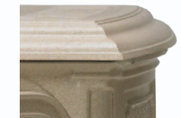
Antique White - CISAW