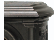
Aged Silver - CISAS