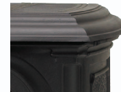
Flat Black - CISB

FMI Cast Iron Stoves offer a sleek presentation with an opening front, curved aquare legs and raised detailing. Several popular decor colors to choose from: Flat Black, Natural Iron, Aged Silver & Antique White.