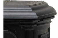
Natural Iron - CISNI