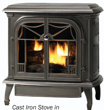
Cast Iron Stove in Aged Silver